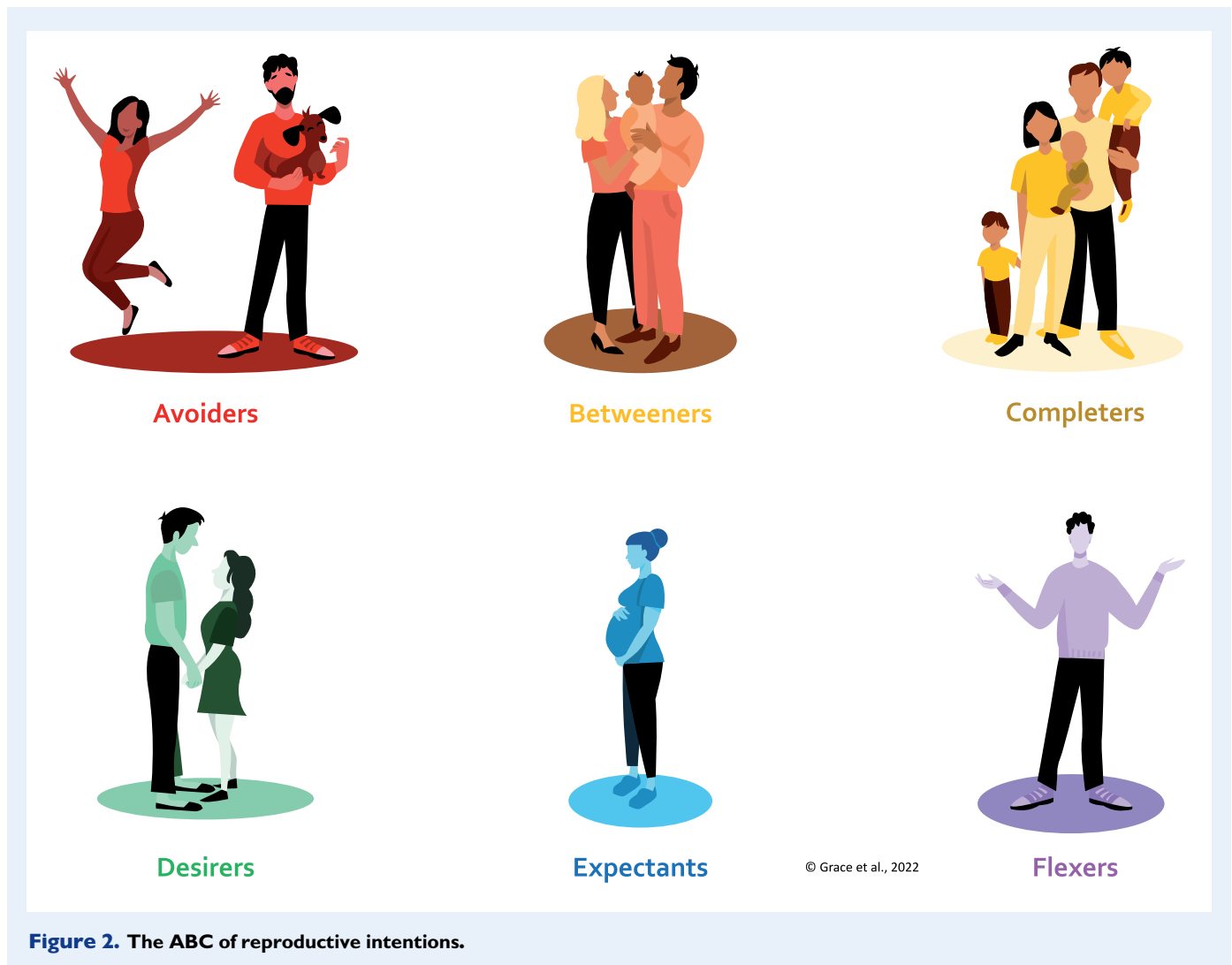
Figure 2. The ABC of reproductive intentions.

graduates and non-graduates. They felt that the timing was important in order to try for a baby. In order to plan for pregnancy, they were talking to their healthcare professionals, taking the right vitamins, taking care of their health, and timing conception to maximize chances.